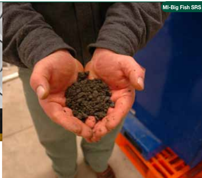
The final product - Class A biosolids - washed, cleaned, dried and ready for land application