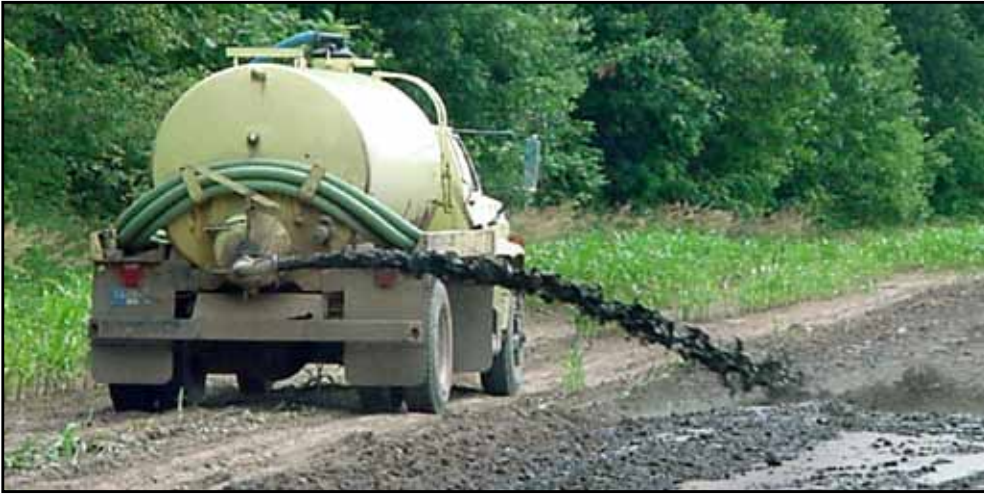
Improper disposal of septage is a problem everywhere. Michigan lawmakers now require haulers to use receiving stations such as the one at Big Fish Environmental