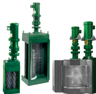
Muffin Monster® and Channel Monster® Grinders