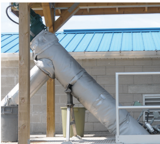
Cold Weather System Insulation Blanket