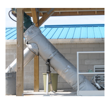
Cold Weather System