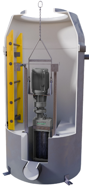
3-HYDRO-C grinder with single lifting point and OSHA compliant ladder