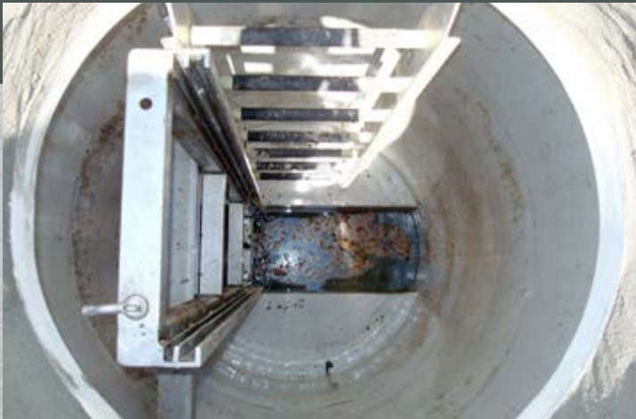
Guide frame and access ladder Inside the MIM (the grinder has been removed)