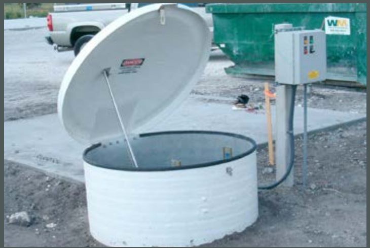
Hatch access door to MIM (street manhole option also available)