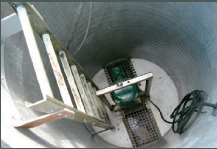
Top view of Monster Industrial Manhole