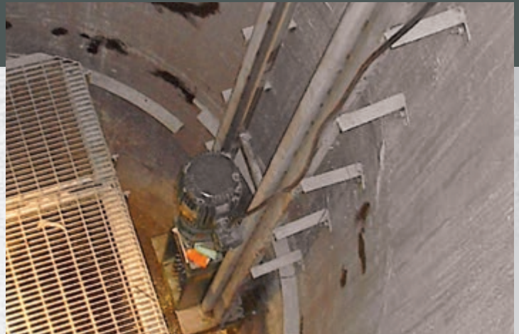
Guide frame and grinder