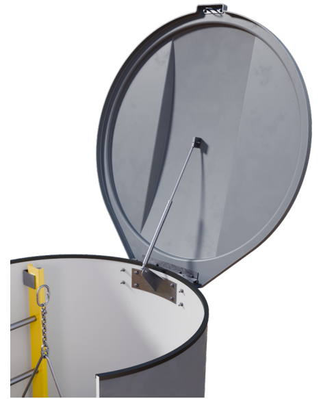
Hatch access for above ground installation