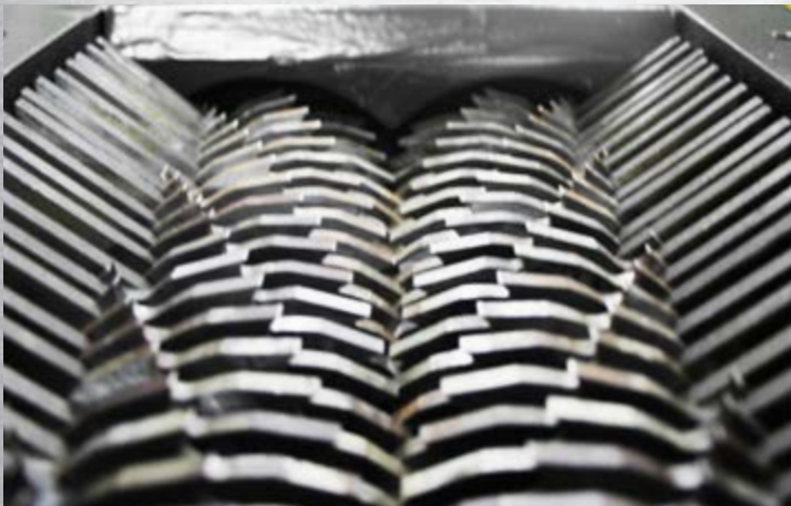
A close view of the cutters